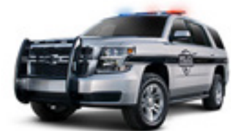
Tahoe Special Services Vehicle (SSV) 5W4