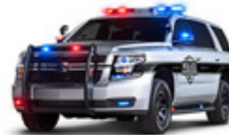
Tahoe Police Pursuit Vehicle (PPV) 9C1

GET THE VEHICLE YOU WANT, THE WAY YOU WANT.