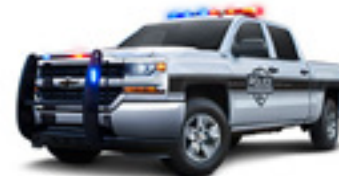
Silverado 1500 Crew Cab Special Service Vehicle (SSV)